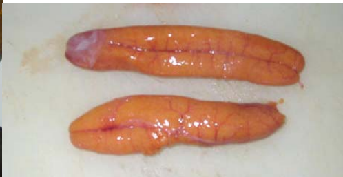
Egg-filled ovaries from a cow dolphin

Tired of eating dolphin (dorado) yet? We have a recipe for the adventuresome angler that wishes to experience some of the finer delicacies of tablefare. Yup, those are the ovaries of dolphin pictured above, and no "revueltos" is not Spanish for revolting!, but yes, dolphin eggs are good to eat (but probably high in cholesterol - have to check that out in Joy of Cooking ). Dolphin eggs can even be found for sale at Key Largo Fisheries. "Huevos revueltos" is Spanish for scrambled eggs. In fact, some say scrambled dolphin eggs taste similar to chicken eggs (but then again, everything tastes like chicken). The ovaries can be broken apart with a fork, sauteed with a little butter, dashed with hot sauce and then spread onto some Cuban bread for a scrambled fish egg sandwich.